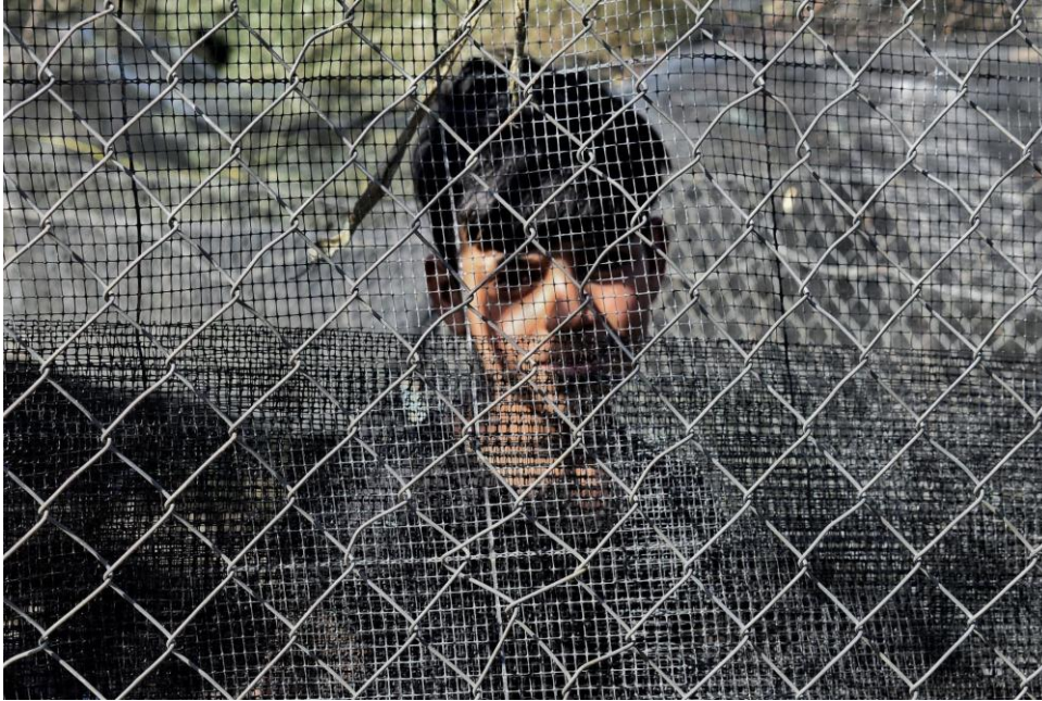
A young boy in Zone 11 of the Olive Grove, outside Moria. August, 2020.

Update on the EU 'hotspot' Moria, by the Greek Council for Refugees & Oxfam